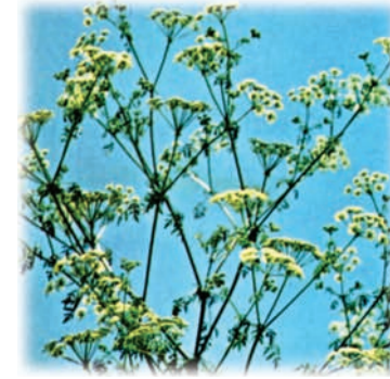
Poison hemlock ( Conium maculatum )