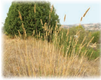
Harding grass ( Phalaris aquatica )