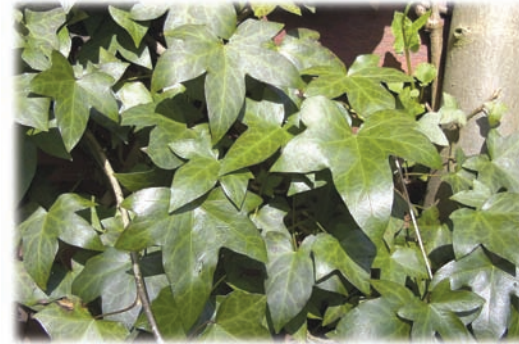
English ivy ( Hedera helix )