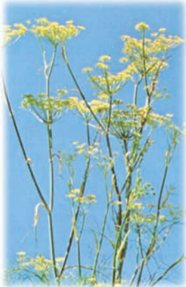
Fennel ( Foeniculum vulgare )