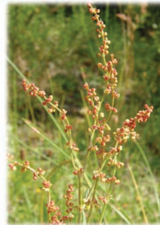
Sheep sorrel ( Rumex acetosella )