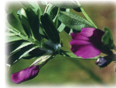
Common spring vetch ( Vicia sativa )