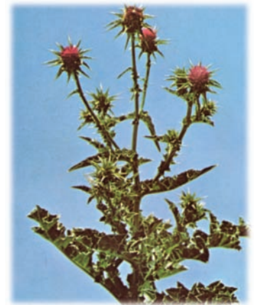
Milk thistle ( Silybum marianum )