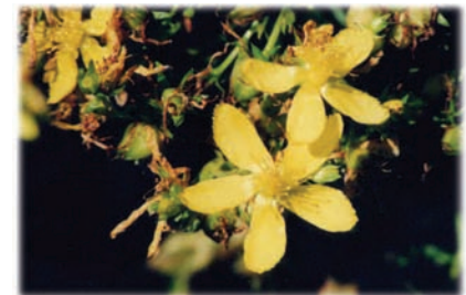
Klamathweed ( Hypericum perforatum )