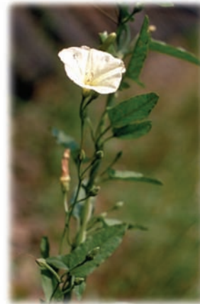
Field bindweed ( Convolvulus arvensis )