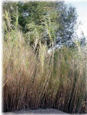
Giant reed ( Arundo donax )