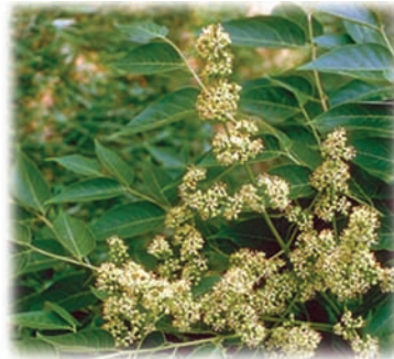
Tree-of-heaven ( Ailanthus altissima )