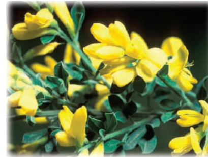
Scotch broom ( Cytisus scoparius )