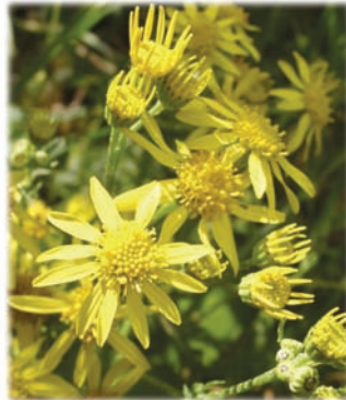
Tansy ragwort ( Senecio jacobaea )