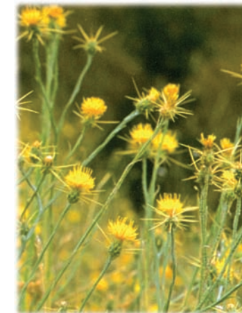
Yellow starthistle ( Centaurea solstitialis )