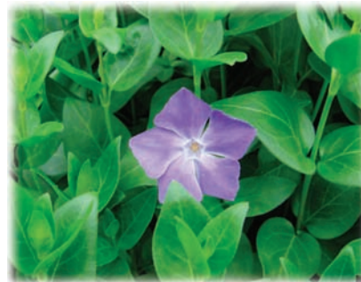
Periwinkle ( Vinca major )