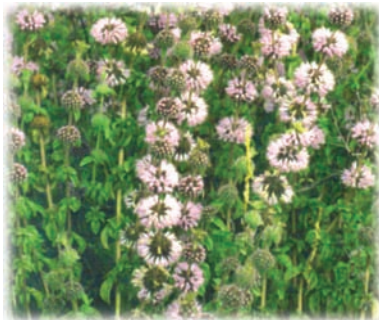
Pennyroyal ( Mentha pulegium )