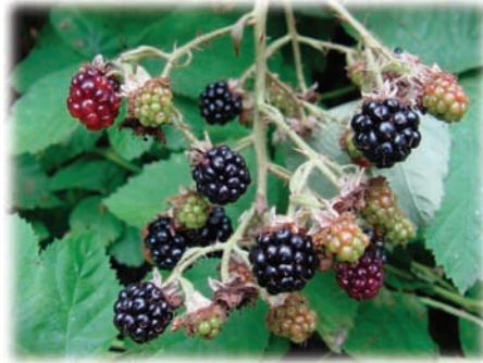
Himalayan blackberry ( Rubus discolor )