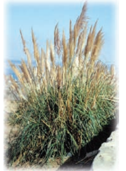
Jubata grass ( Cortaderia jubata )